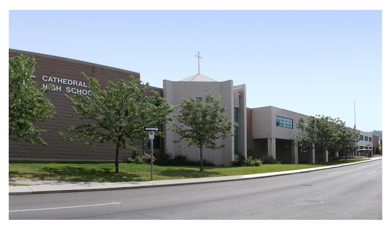
In 1992, Cathedral Boys' School and Cathedral Girls' School came together to form Cathedral High School. In 1995, a new school facility was constructed on a 6.68 acre property on Wentworth Street North. The 17,658 m² state-of-the-art building was officially blessed by Bishop Anthony Tonnos on October 1, 1995.